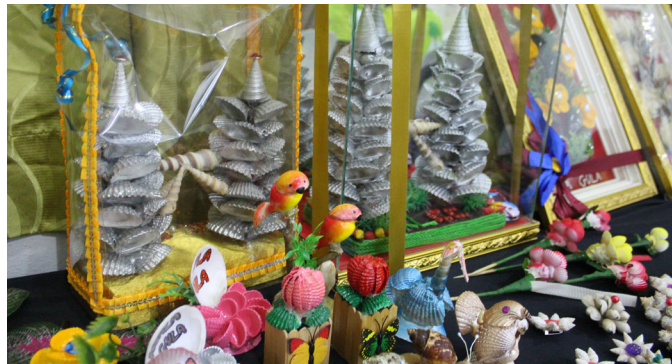
Printed in 2020.

SHBG 2020 welcomes orders and requests for ecotourism services, mangrove planting and the purchase of mangrove-based products.