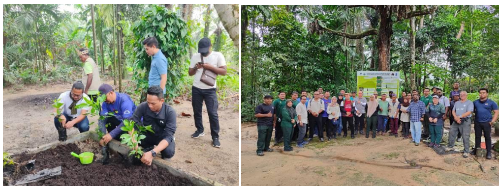
Johor State Forestry Department study visit to GEC – CoSPeC, RMFR and HSKLU proved to be valuable and insightful one

During this reporting period, GEC also hosted four (4) visits to GEC-CoSPeC and RMFR from various agencies including the National Peatland Agricultural Management Technical Committee, IFAD Implementation Support Mission (ISM) for Sustainable Management of Peatland Ecosystems in Malaysia (SMPEM – GEF6), Johor State Forestry Department and Sarawak Forestry Department and Selangor State Forestry Department (SSFD).