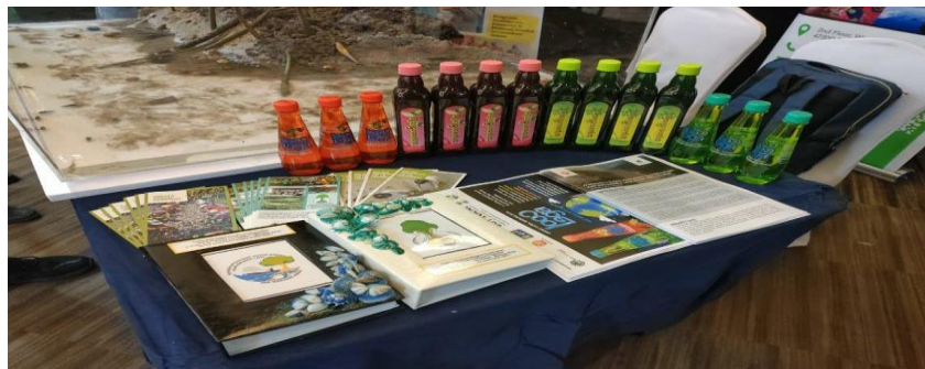
Coolega and Mangroovist – the mangrove-based products (drink) developed and

During this reporting period, GEC also hosted four (4) visits to GEC-CoSPeC and RMFR from various agencies including the National Peatland Agricultural Management Technical Committee, IFAD Implementation Support Mission (ISM) for Sustainable Management of Peatland Ecosystems in Malaysia (SMPEM – GEF6), Johor State Forestry Department and Sarawak Forestry Department and Selangor State Forestry Department (SSFD).