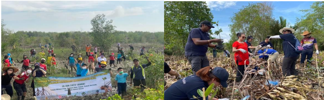
Mangrove tree planting been conducted with community, public, school students and private sector.