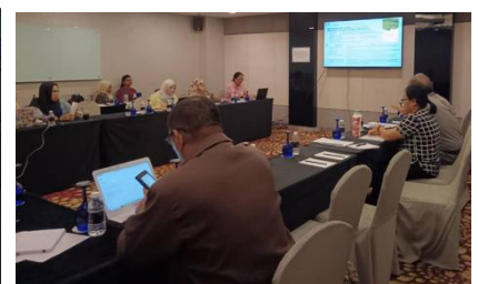
(L-R) Meeting with Pahang and Sabah Stakeholders, and the Inception Presentation with JPSM, NPMO and SPMO.

The design mission for Sustainable Agriculture and Plantation/Forests in Peatland Landscape in Malaysia (SAPPLIM/SAFPLIM) with IFAD and the Government of Malaysia is ongoing: the second mission (November) to discussion further on proposed landscapes and preparation for third mission (January 2025) to visit Kinabatangan Landscape, Sabah.