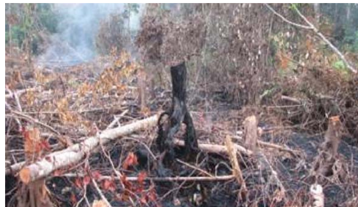
Fires are commonly used when preparing the land.