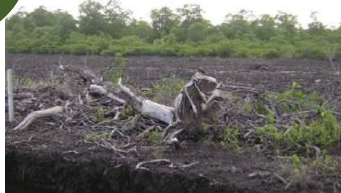
Peatlands found behind mangroves in Cambodia.

Fires on peatlands contribute significantly to carbon emissions and have severe health and socio-economic consequences. Peat and forest fires in the region in 1997/98 contributed to the largest annual recorded increase in atmospheric CO 2 concentrations. Approximately 500,000 people in the region received treatment for respiratory related problems; economic and environmental losses have been estimated at US$9 billion. Transboundary smoke haze has been identified as one of the most severe environmental problems in the ASEAN Region. It led to the adoption of the ASEAN Agreement on Transboundary Haze Pollution (AATHP) in 2002 and the endorsement of the ASEAN Peatland Management Strategy 2006-2020 (APMS).