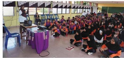
The financial literacy session by OCBC Bank Tebuk Intan branch at SK Seri Mawar.

Primary school pupils have more conducive learning environment