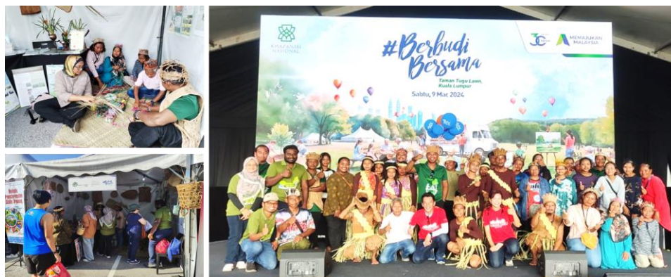
GEC-SGAT's Exhibition during “Berbudi Bersama Khazanah Nasional” event at Taman Tugu

GEC and SGAT were invited as guest panellists to the 37 th Ilmu Hasanah Forum on March 19 to share their experience on the importance of community leadership in ensuring the sustainability and continuity of project activities after completion by Yayasan Hasanah.