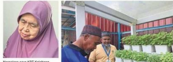
Nonozian says KRT Kuninggan sustain soil cover to 100,000 bottles of keepack in the last three years.

stretching 6.86km. "The main aim is to uplift views of mountains, the city, waterfall and also the river," he said.