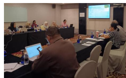
(L-R) Meeting with Pahang and Sabah Stakeholders, and the Inception Presentation with JPSM, NPMO and SPMO.

The design mission for Sustainable Agriculture and Plantation/Forests in Peatland Landscape in Malaysia (SAPPLIM/SAFPLIM) with IFAD and the Government of Malaysia is ongoing: the second mission (November) to discussion further on proposed landscapes and preparation for third mission (January 2025) to visit Kinabatangan Landscape, Sabah.