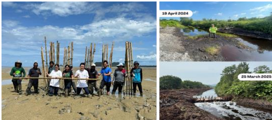
Conservation efforts and partnerships via collaborative projects, meetings, field assessments, rehabilitation, infrastructure development, and peatland ecosystem studies.