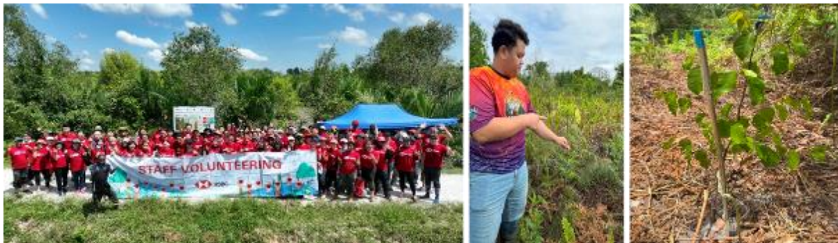
Tree planting efforts under GEC's partnership initiatives across various locations.

Under various partnership initiatives, GEC planted over 7,314 trees with 158 local community members and volunteers. This included 5,900 mangrove trees in Kampung Dato Hormat, Selangor, Kuala Gula Forest Reserve, Perak, and Kuala Sungai Muda, Kedah, as well as 1,414 peatland trees in Gunung Arong Forest Reserve, Johor.