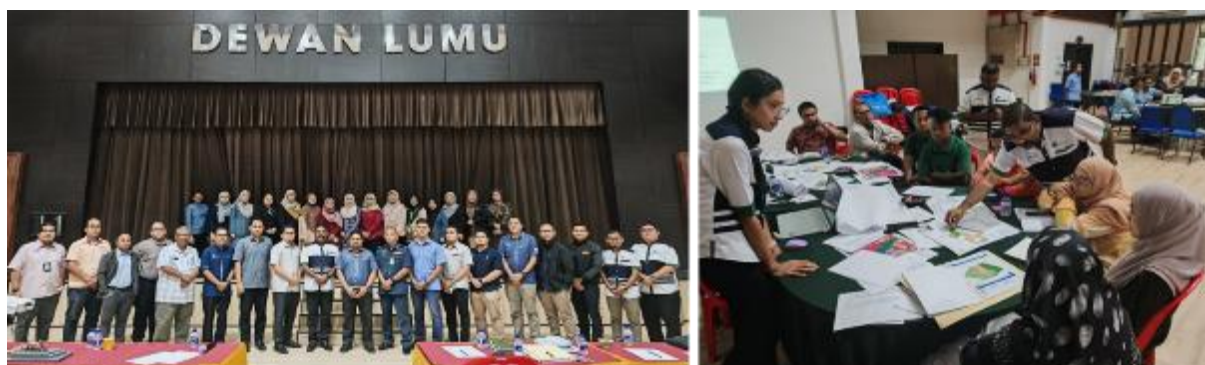
Collaborative discussions with SSFD, UPM, and SMPEM-Selangor to review and finalize the Integrated Management Plans (IMPs) for North and South Selangor Peat Swamp Forests.