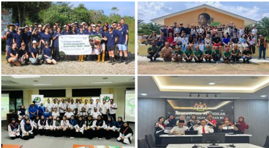
Environmental education programmes and initiatives