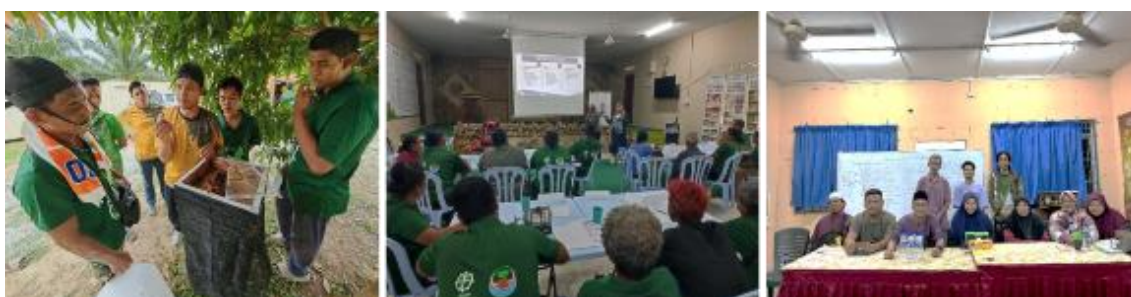
Community-based initiatives with local groups including coordination meetings, training and sustainable livelihoods.